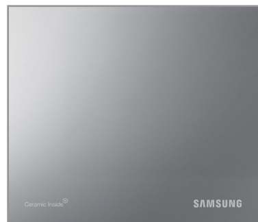
Shiny Mirror Design