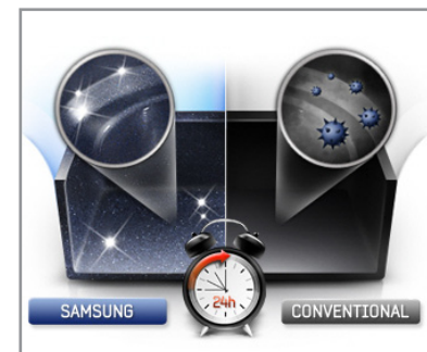
Ceramic Enamel Interior